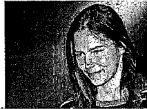
First Person: Glaring Errors in Knox Case