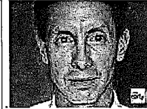
Warren Jeffs jury selection begins