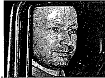
Norway Suspect Doesn't Expect Release