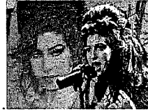
Police: No Cause of Death in Winehouse Autopsy